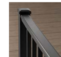
IMPRESSION RAIL EXPRESS®

Unlike some wood railings, all TimberTech® Rail profile designs are tested by a third-party, independent agency to ensure safety code compliance standards are met or exceeded. TimberTech Railings undergo rigorous testing and are engineered for safety and strength.